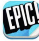
EPIC books for kids