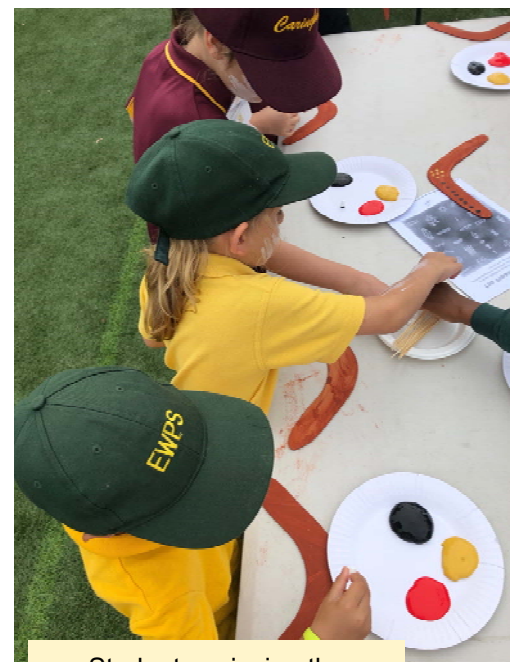
Students enjoying the One Mob cultural experience