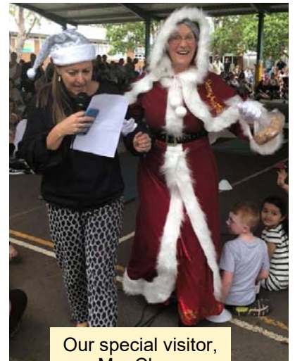
Our special visitor, Mrs Claus