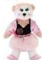
TALIA THE DANCE CLASS BEAR BK817