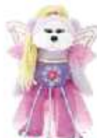
ARIA THE MUSICAL FAIRY BEAR BK831