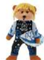
COREY THE SURF BOY BEAR BK847