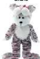
PEONY THE TIGER BEAR BK751