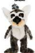
LEAPY THE LEAMUR BEAR BK876