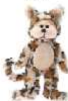
SAHARA THE LEOPARD BEAR BK810