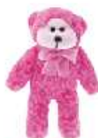
CUDDLES THE FLUFFY BEAR BK858