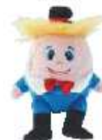
HUMPTY DUMPTY THE BEAR BK829