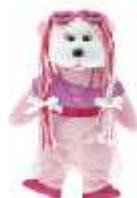
SIENNA THE GIRLY GIRL BEAR BK843