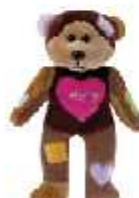
PATCHY THE BEAR BK848